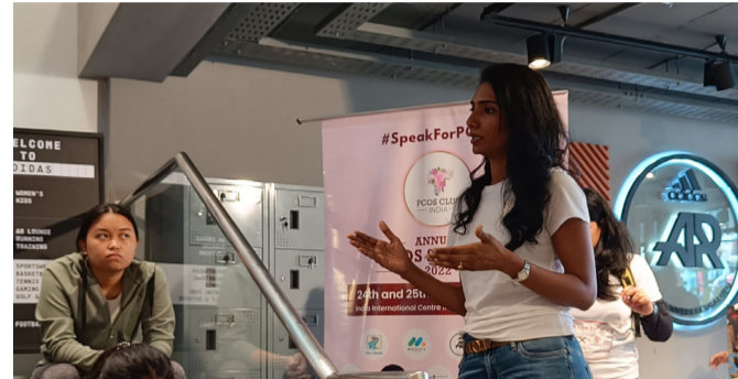
Panel discussion in Brigade Road

drain out of the body. Women with PCOS experience irregular menstruation, and their bleeding is abnormal. When asked about repetitive consumption of birth control pills and painkillers, Dr Reddy responded that you should take one whenever necessary after consultation with a doctor. She added that micro-pharmaceutical