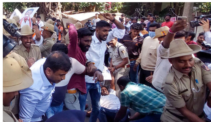
BJP protestors being arrested by police

ment's interim budget was presented, MP DK Suresh said that Karnataka was being treated unfairly by the central government. "No grant has been released in this budget. All the grants are being given to the states of North India. If this keeps repeating, then a separate nation of South