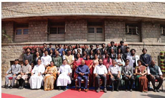
Shri Ram Nath Kovind at SJU

OpenHeart is the flagship premiere talk show hosted by the Public Relations Office of the University, this edition of the show, hosted the former President with over a thousand attendees including students, teachers, faculty, and government officials. The International Students Information Brochure, which