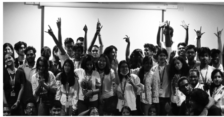
Fresh faces of BDMA