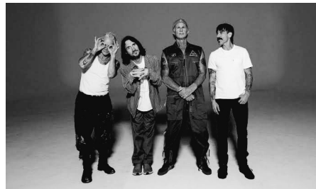
"Choose not a life of imitation"

The rock band Red Hot Chilli Peppers reunited last week after six years and released their new album 'Unlimited Love'. The audience called it "nothing new, but that's the point." Red Hot Chilli Peppers was formed in 1983 with four members - Anthony Kiedis, Flea, Chad Smith and John Frusciante. John Frusciante is known to have left the band twice, but last week the members reunited for the release of their 12th studio album. The music this time is a blend of rock and punk with their first single track "Black Summer."