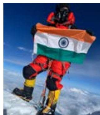
Making History Special Arrangement

"Taking one step back is not a big deal," said the climber, referring to when she had to cut her Dhaulagiri expedition short, suffering