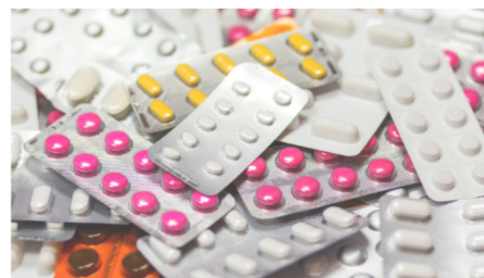
When pain relievers increase pain

The doctor further added that there is an increase in the prices of raw materials which goes into manufacturing drugs that are imported from various parts of Europe and China, however, this is not an excuse for pharmaceutical companies to increase the price of all medicines both essential and non-essential. The most affected by the price rise are patients