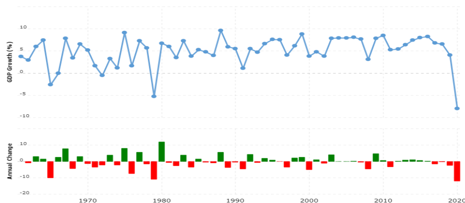
Downfall of Indian Economy

The pandemic did contribute to the present slowdown. However, the crisis seems to have begun much before the health crisis set in. This is evident from the fact that the GDP growth nosedived in the two years preceding the pandemic. Rather than adopting policy measures to halt the downward trend, all the government did was manage the resentment of the public by handing out doles in terms of cash transfers and free rations. To finance its social welfare measures, the government invariably expanded its indirect tax net by steeply increasing the duty on crude oil and collected a whopping amount of 8 lakh crore in four years which is un-