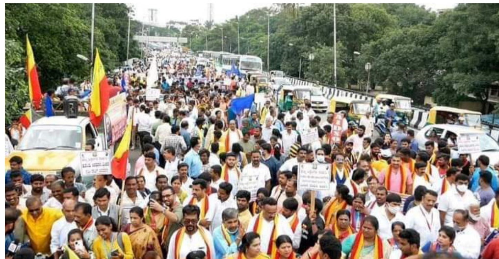
United in the fight against injustice