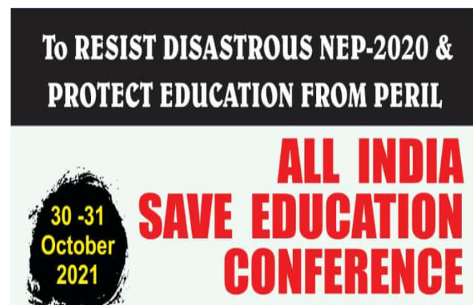
AISEC Official Poster

Romila Thapar, Irfan Habib, Sukhadeo Thorat, and other eminent personalities from across the country have