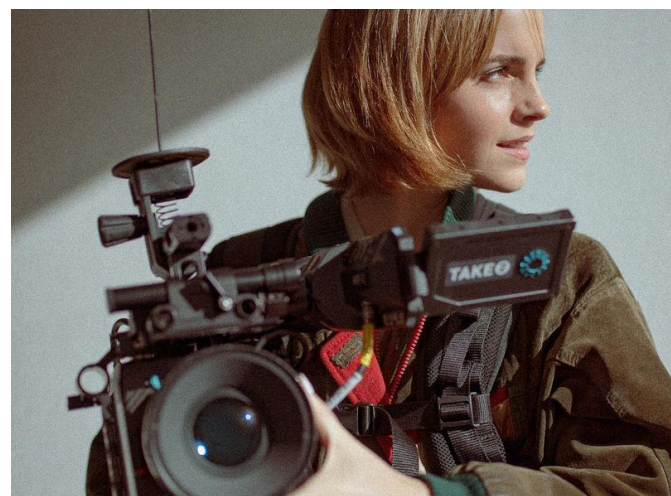
Watson's new journey

She also reflected on the effective role of a cinematographer to tell a