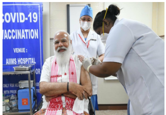
Modi gets his jab