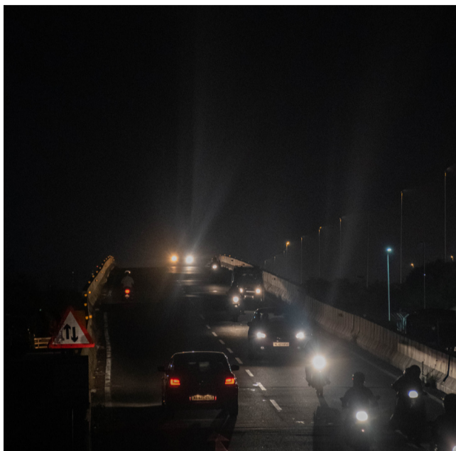
Places to be