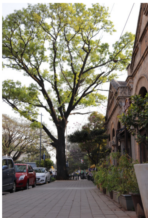
Where to next