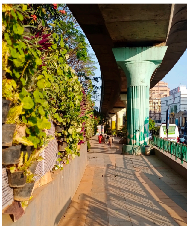
Long way to go