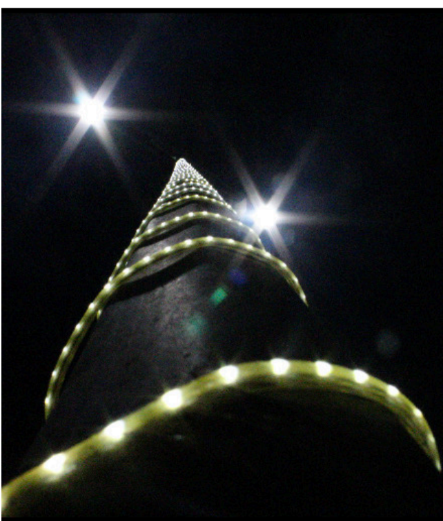
Stairway to heaven

Leading lines are lines that appear in a photograph that have been framed and positioned by the photographer to draw the viewer's eye towards a specific point of interest. These lines often draw the viewer's eye in a specific direction or towards a designated portion of the photograph. Here we present to you common spaces and places where leading lines are found naturally.