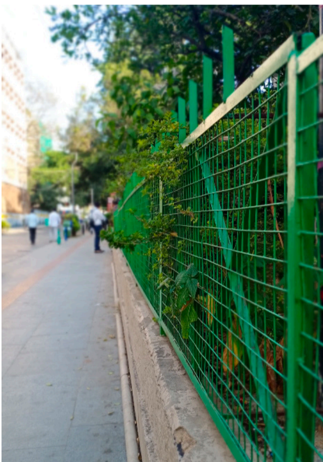
Between fencing lines