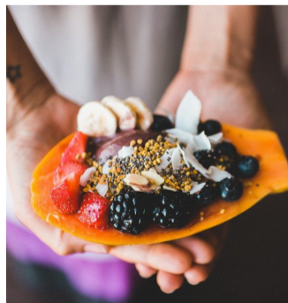
Representation Image Creative Commons

"We witnessed a 20-30 percent rise in sales this year as compared to last year. The market is definitely on the rise, with a lot more vegan food joints in Bengaluru." He added: "There are a lot