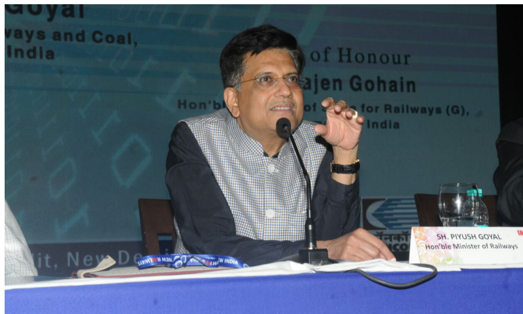
Railway Minister Piyush Goyal

He added, "As of now, with a heavy heart we have started working in the Gujarat