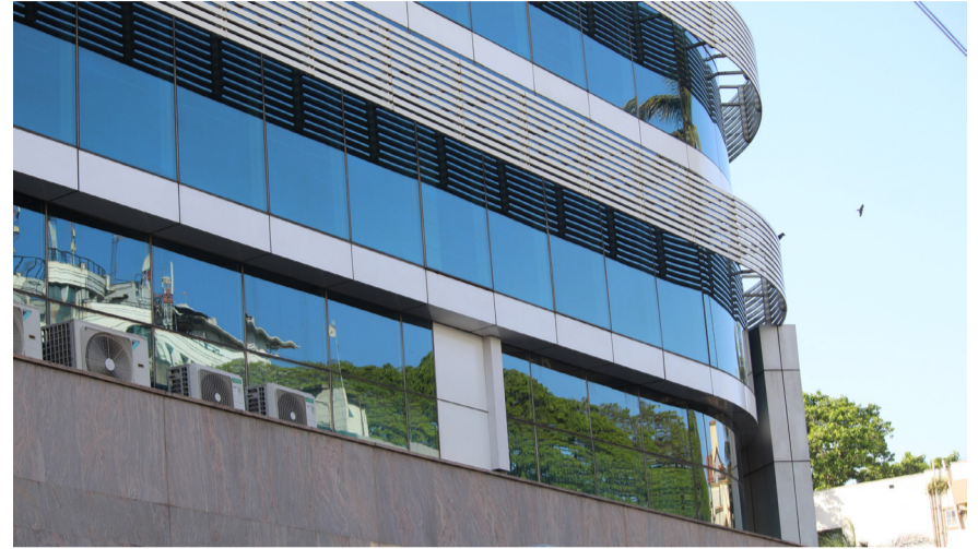
The jungle we have vs. the one we need