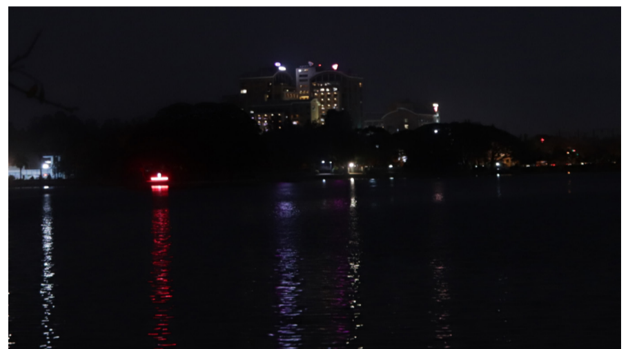
Nights and lights