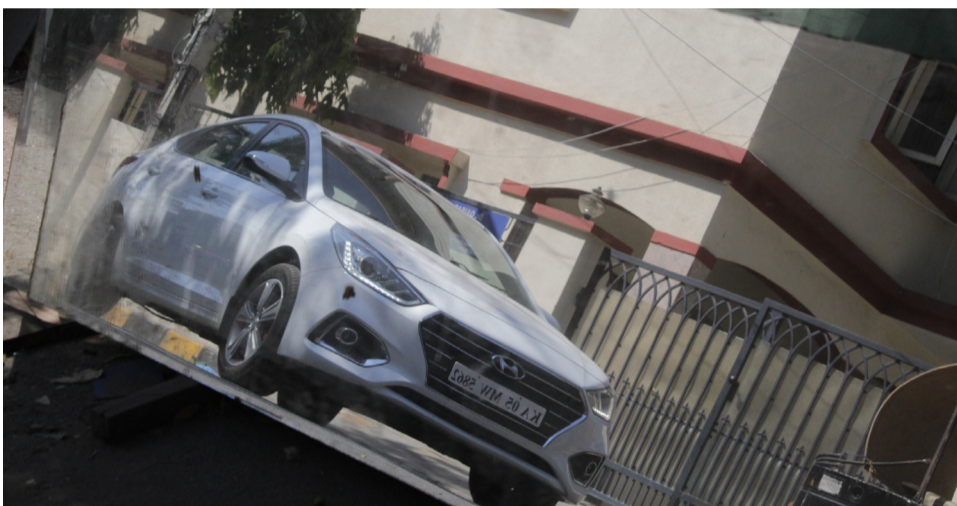
Time to hit the road