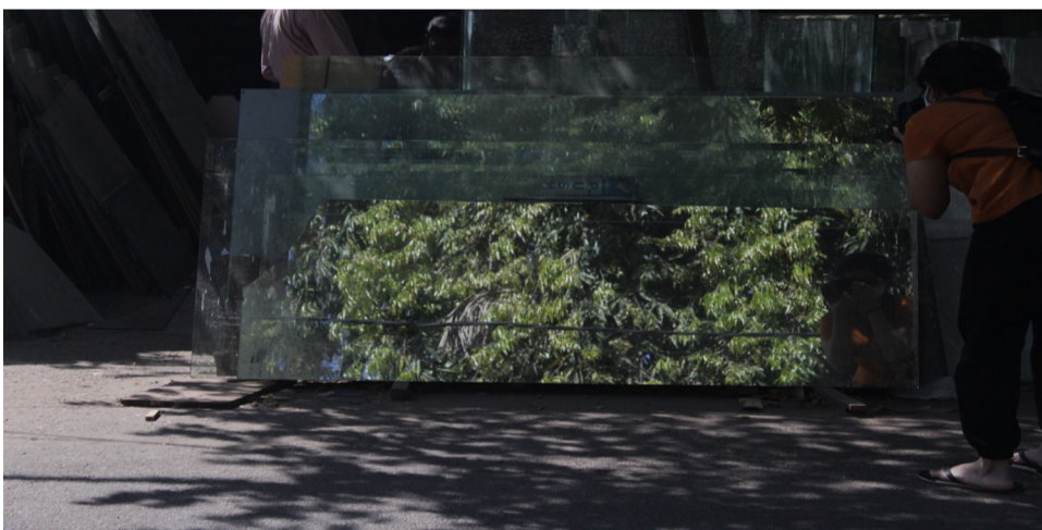
Peeks of sunshine