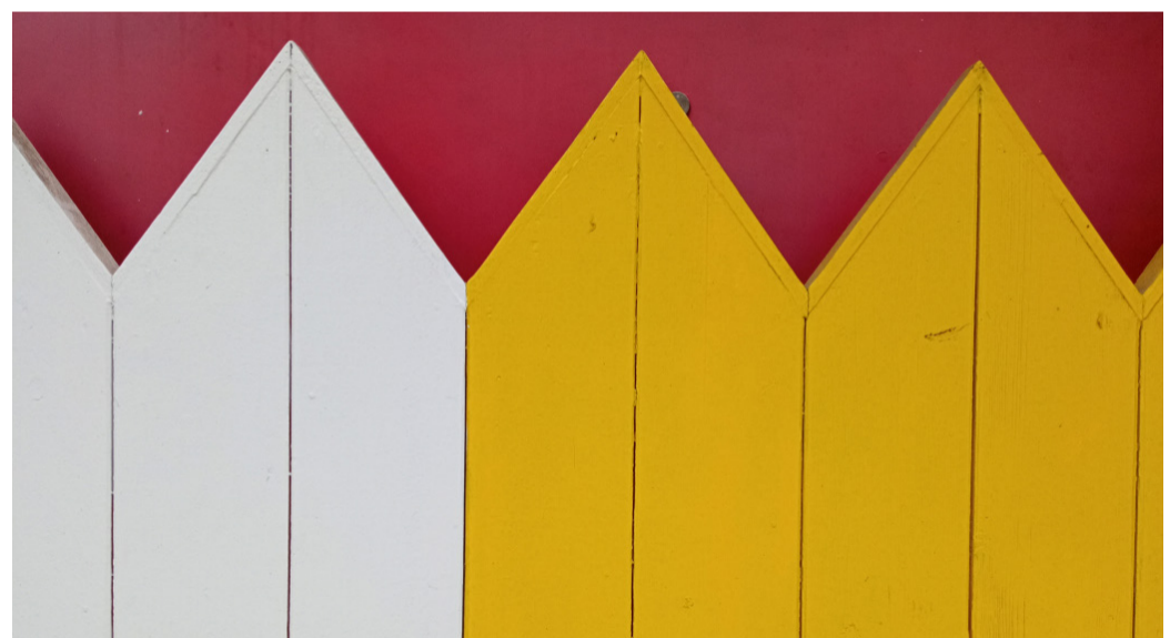
Sitting on fences