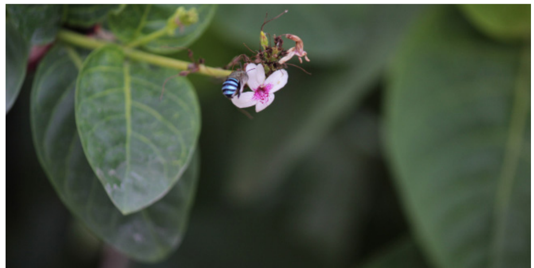
Ration for the day