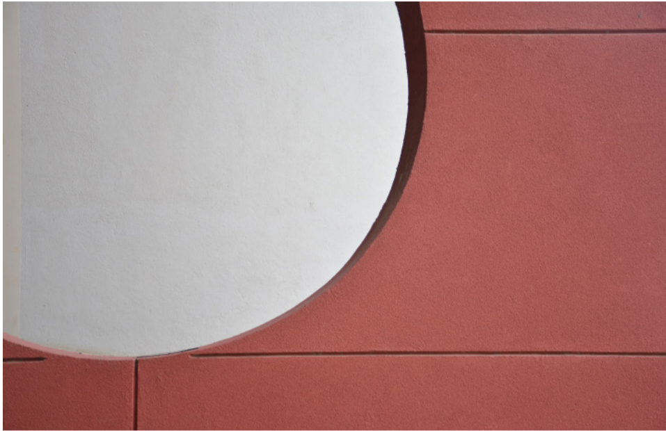
Capture the frame

Saturday, April 03, 2021 / St. Joseph's College (Autonomous) / Vol : 12; Issue : 27 / www.sjcdeptcomm.wordpress.com