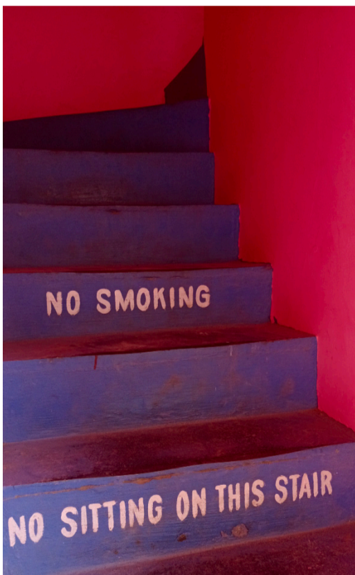
Rules are rules

Colour contrast is when two different colours at the opposite spectrum of the colour wheel are put together. The further away from each other two colors are, the higher the contrast. It is used to depict stark and glaring difference and also used to highlight a particular part of the image in photography.