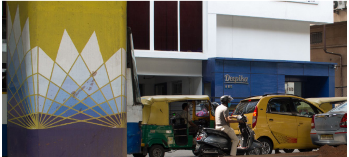
Colour of chaos