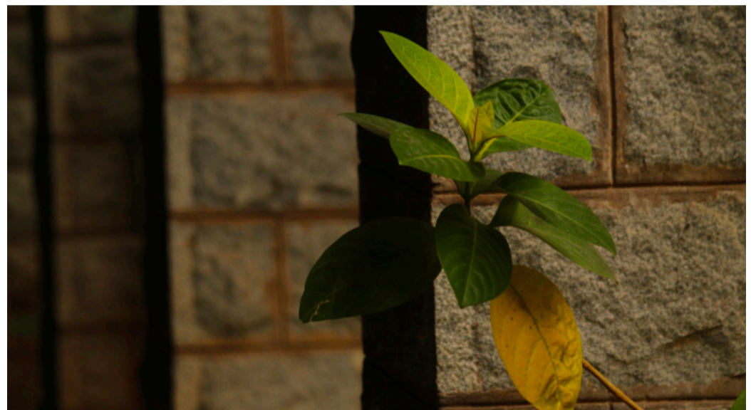
Centre of attention