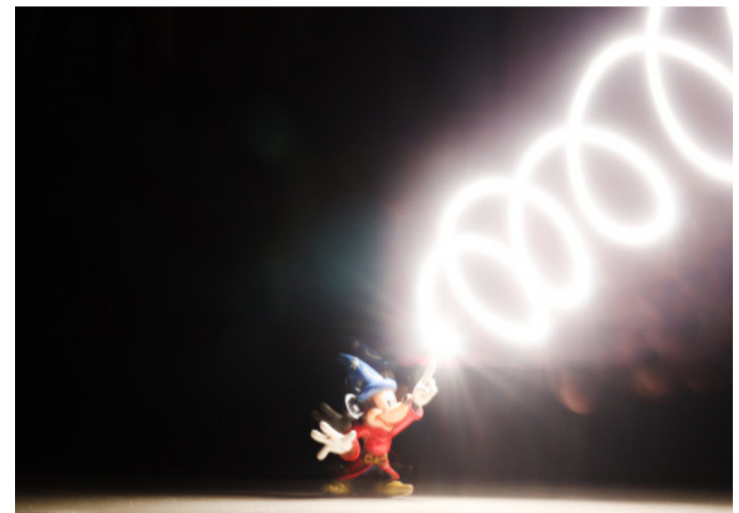
Magic from the finger tip