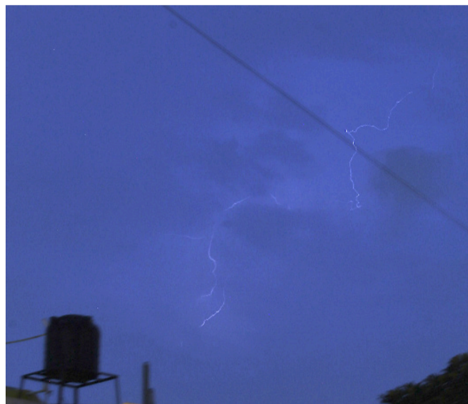
Lightning before the thunder

Sometimes called light drawing or light graffiti, light painting is the photographic technique of using a moving light source like flashlight, glow stick, light brush, etc. to alter an image while taking a long exposure photograph. Instead of just capturing an image as it is, light painters add another element by highlighting an object or creating streaks, colors, or flashes within the image which is seen in this issue.