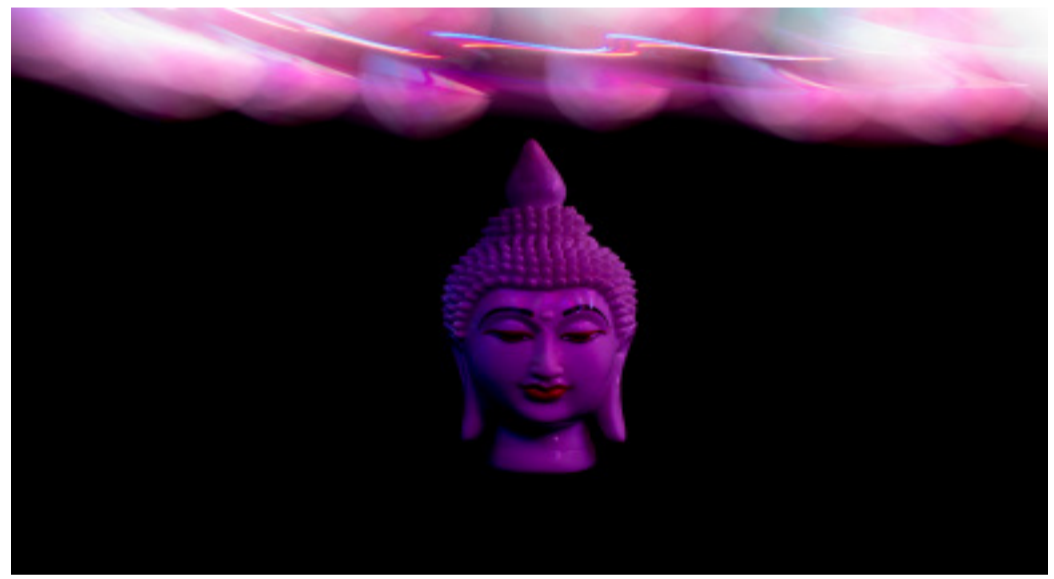
Trippy state of mind