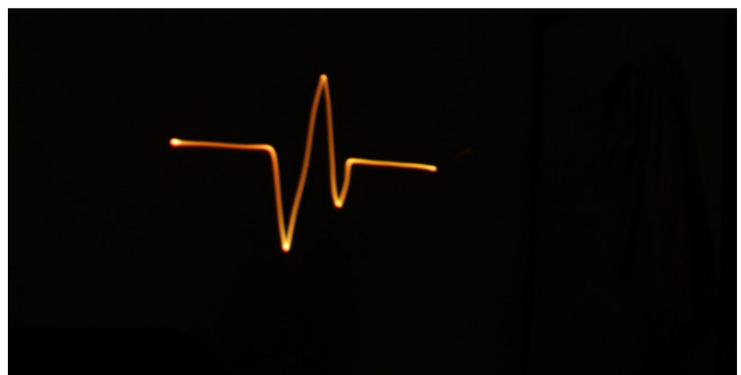
Beating to the rhythm