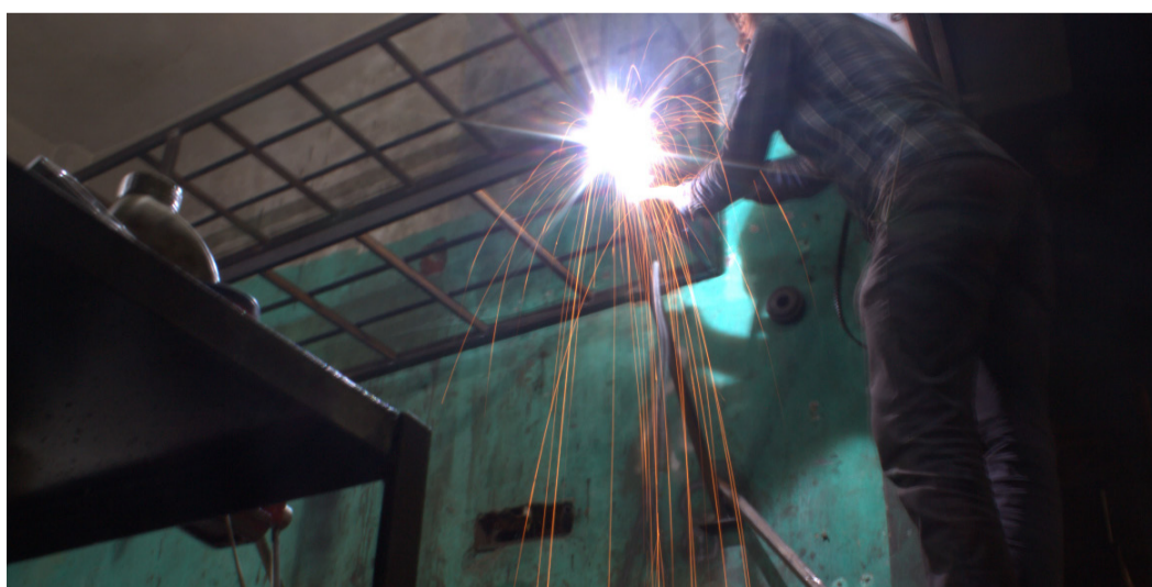
Rain of fire